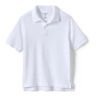
School Uniform Kids Short Sleeve Mesh Polo Shirt