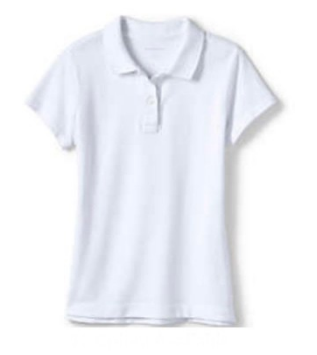
School Uniform Girls Short Sleeve Feminine Fit Mesh Polo Shirt