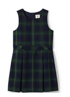
School Uniform Girls Plaid Jumper Top of Knee