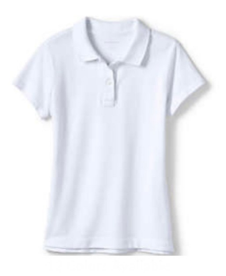
School Uniform Girls Short Sleeve Feminine Fit Mesh Polo Shirt