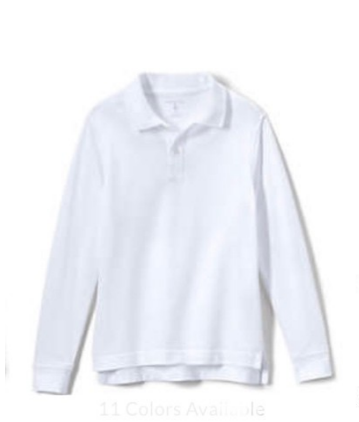
School Uniform Kids Long Sleeve Mesh Polo Shirt