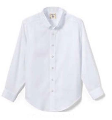
School Uniform Boys Long Sleeve No Iron Pinpoint Dress Shirt Lands' End