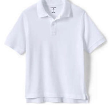
School Uniform Kids Short Sleeve Mesh Polo Shirt