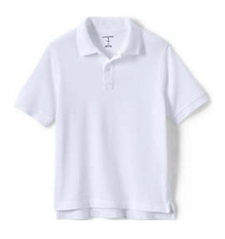
School Uniform Kids Short Sleeve Mesh Polo Shirt