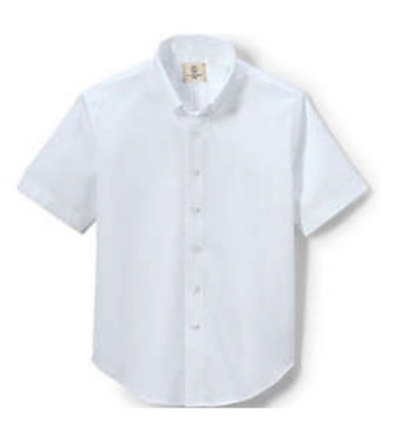
School Uniform Boys Short Sleeve